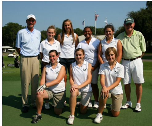
Beaufort High School Women's Golf

ANSWER: The first possibility for a student-athlete to be ruled academically ineligible would occur in January 2013.