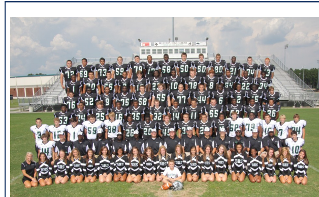
Bluffton High School Football