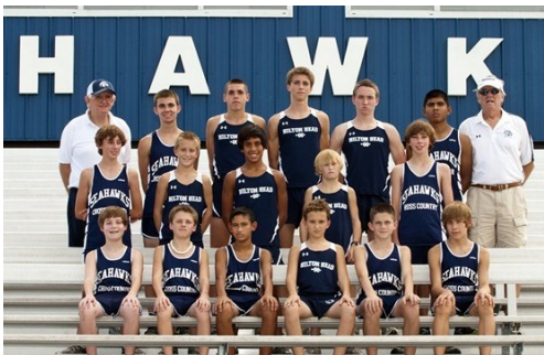
Hilton Head Island High School Cross Country