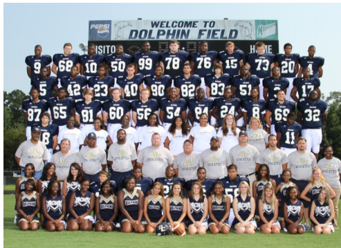
Battery Creek High School Varsity Football